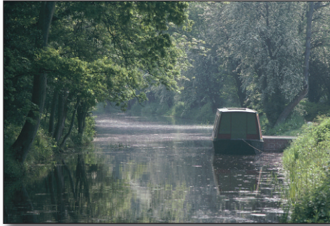
A sylvan scene on the restored section of the Wey & Arun Canal near Loxwood.