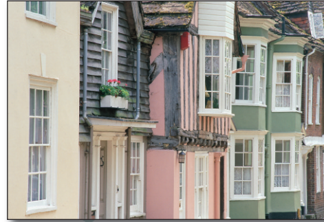
The Causeway, Horsham.