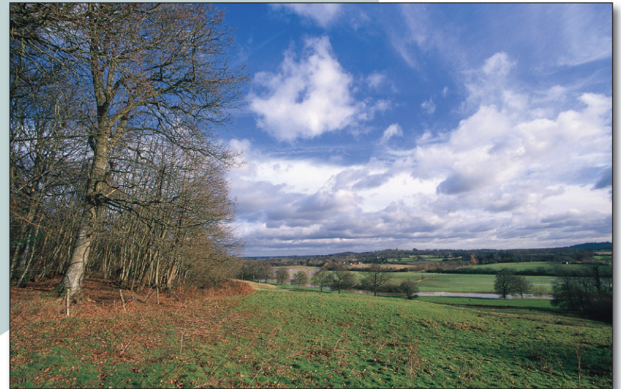
The view looking towards the upper reaches of the River Arun from near Harwoods Green above Stopham.