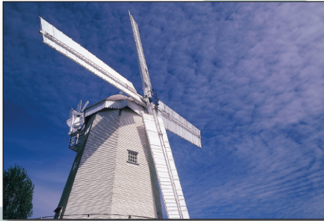
Almost at the heart of Sussex, Kings Mill at Shipley, built in 1879, is the largest 'smock' mill in the county.