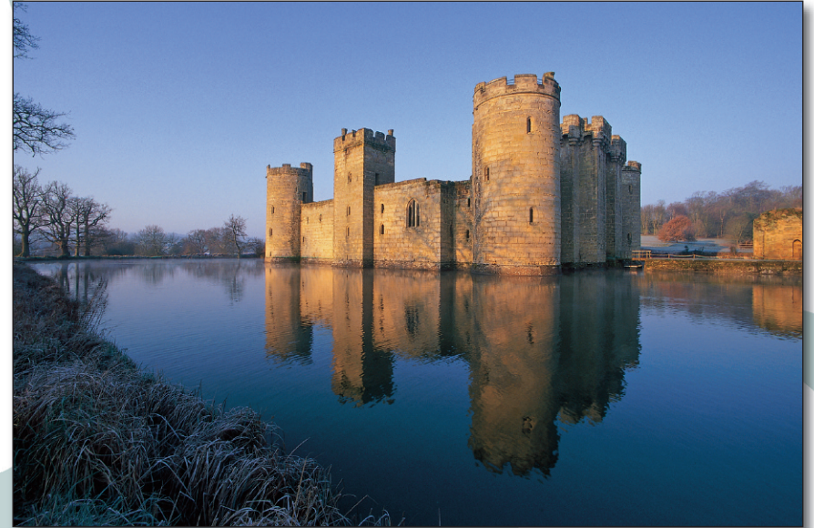
Winter reflections, Bodiam Castle.