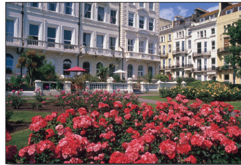
The stuccoed Victorian seaside terraces around Warrior Square just to the west of the modern centre of Hastings.